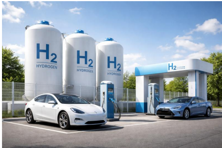
Hydrogen tanks and vehicles, Image: AI generated by MCL

Project: PREHY, 10/2022-12/2025, single-firm