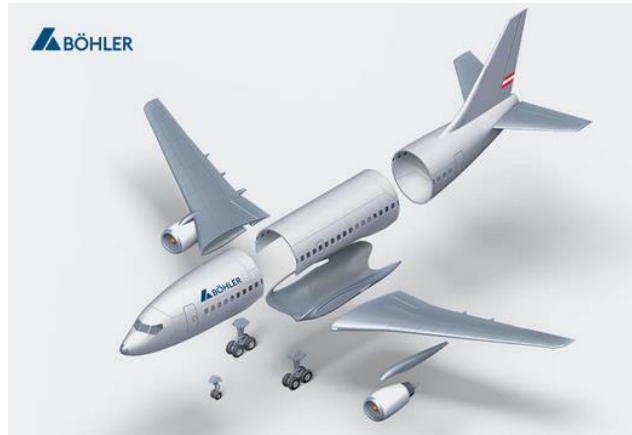
Structural parts in aircraft that are manufactured by voestalpine Böhler Aerospace

Type of project: MarTough, 2020 - 2025, multi-firm