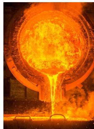
Steel transport vessel in use

computer models are already used by the industry partners of the project to improve the design of linings, such as those shown in the following Figure, that are used in metallurgical plants at high-temperatures. Furthermore, the new test methods and the newly gained material data also provide a sound basis to advance material development. Both, new materials and the availability of new computational design tools will strengthen the international competitiveness of the company partners.